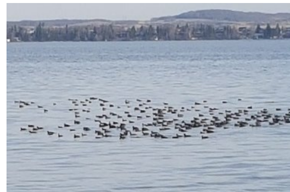
Picture Caption: To make your document look professionally produced, Word provides header, footer, cover page, and text box designs that complement each other.

Keeping Wabamun Lake “Clean and Clear” requires each one of us to be engaged in the protection of the watershed. There are many aspects, many areas to get involved in. It can be overwhelming to know where to begin. Importantly, it does not matter where you begin to get involved, just PICK ONE aspect to delve in to, to participate in. The motto of WWMC is ‘Keep Wabamun Lake Clean and Clear’; this is in fact a collective responsibility - Let's Keep Wabamun Lake Clean and Clear . Now more than ever we must have a strong bold collective voice and action to protect the lake and watershed. Visit WWMC.ca for information on the watershed and ideas to get involved. Connect with us to share your involvement in protecting the lake and watershed or your interest in getting involved. info@wwmc.ca